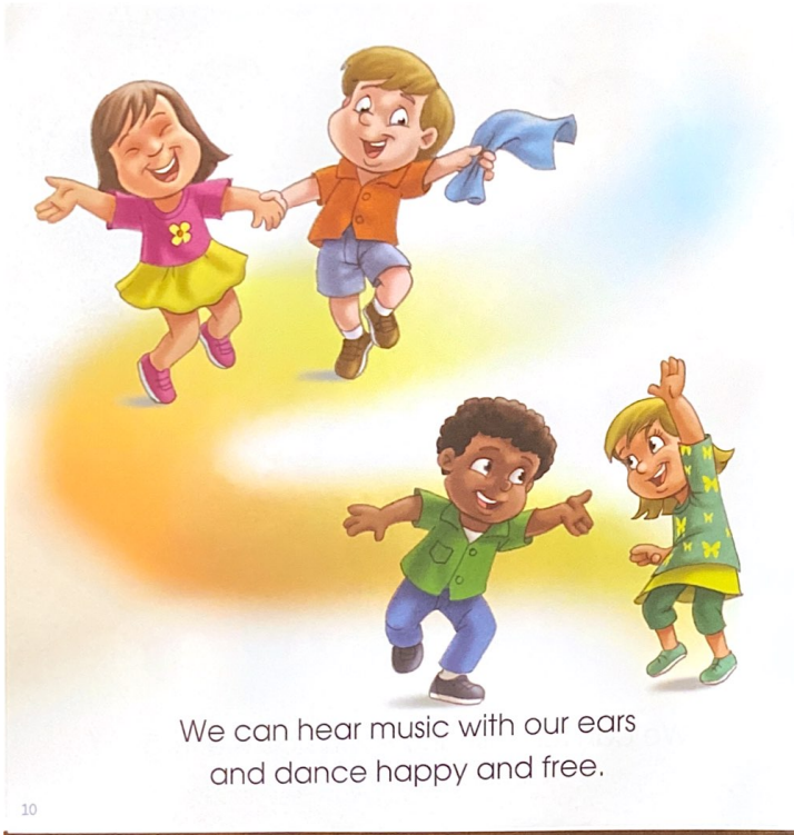
We can hear music with our ears and dance happy and free.